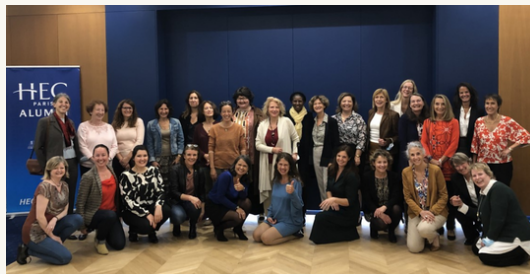
The Women@HEC team